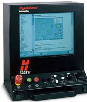
EDGE Ti CNC Controller with touch screen